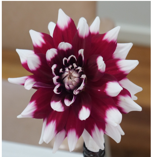
Stem of a flower 2 nd Ralph Slaughter