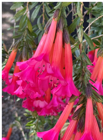
Sacred flower of the Incas