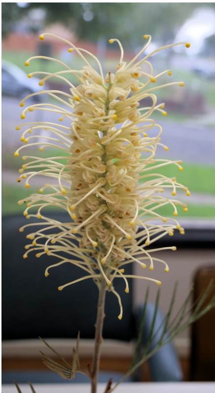
Flowering shrub 1 st Heather Coustley