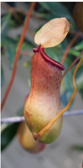
Tropical pitcher plant

A wide variety of some very interesting plants, all in absolutely wonderful condition made for an interesting day out for our members. Thanks to Suzanne for organising this event.